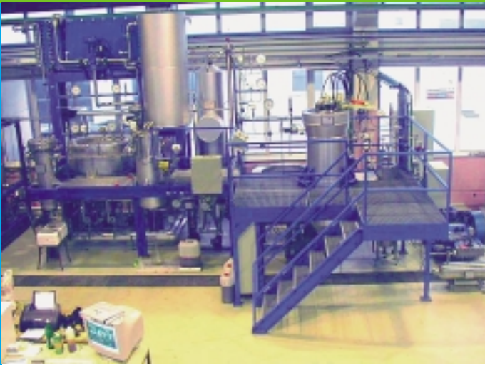
80 l - 550 bar Pilot Plant