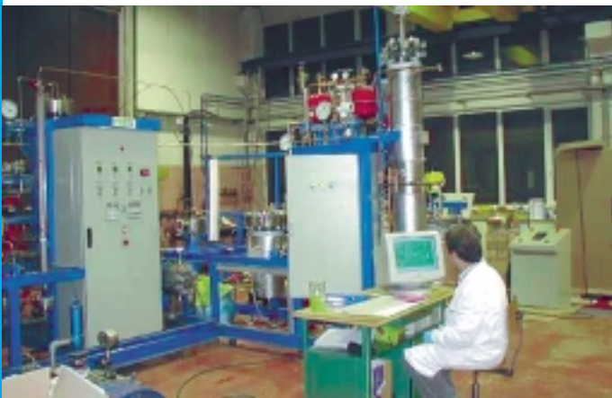
Thin Film Extractor