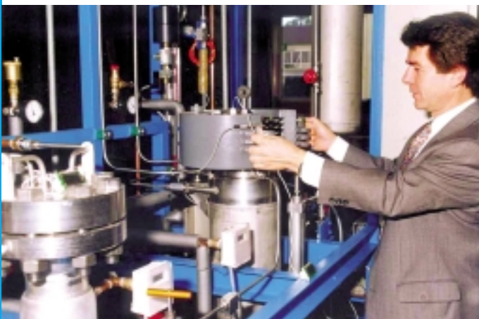
5 l - 1000 bar R&D Unit