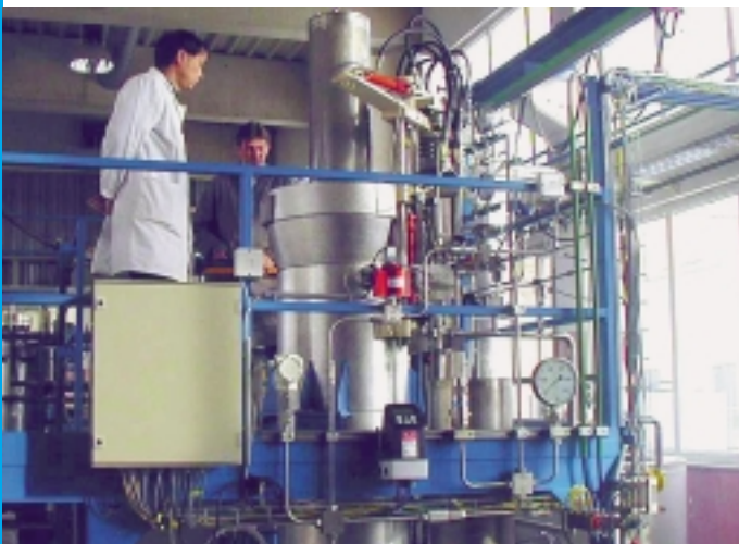
80 l - 550 bar Extractor